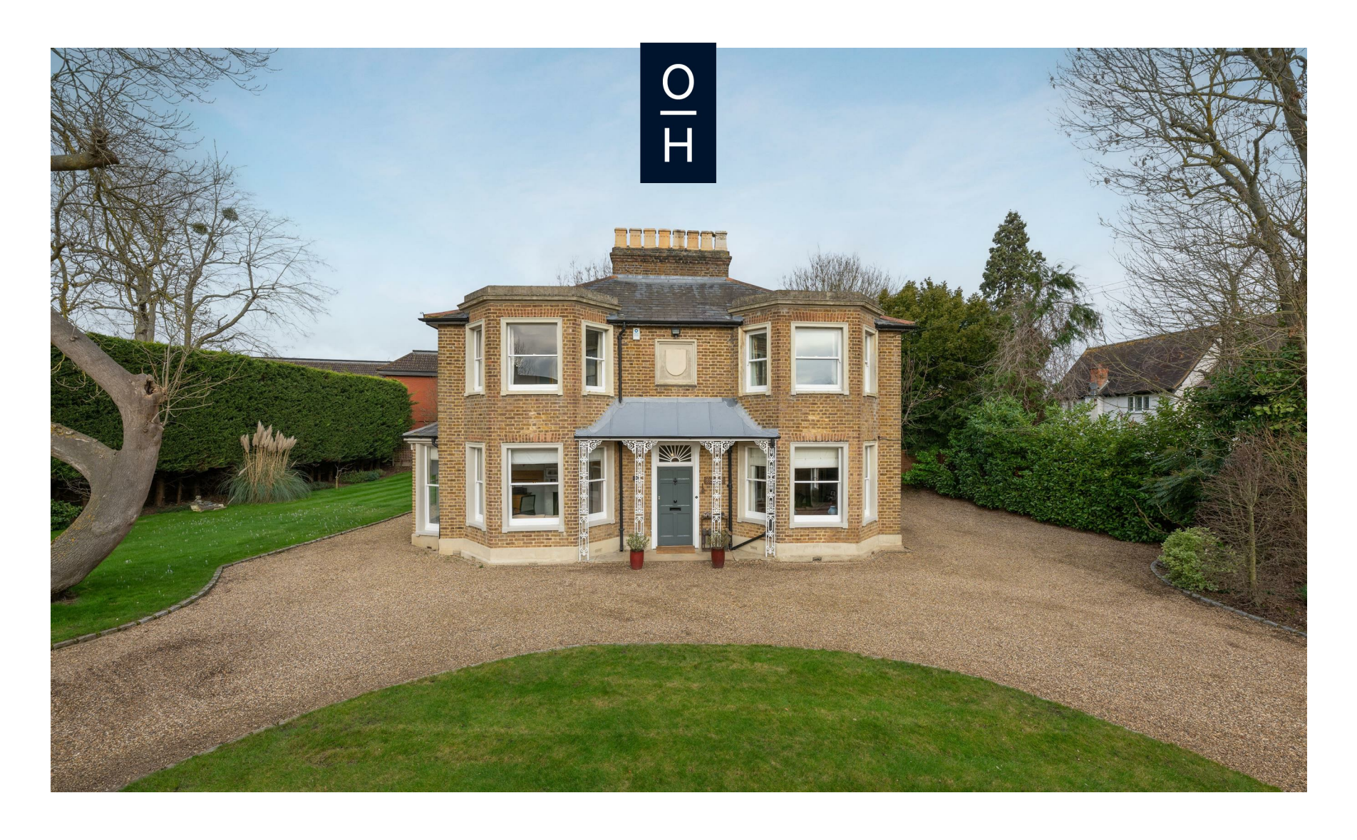
Winkfield Road, Windsor