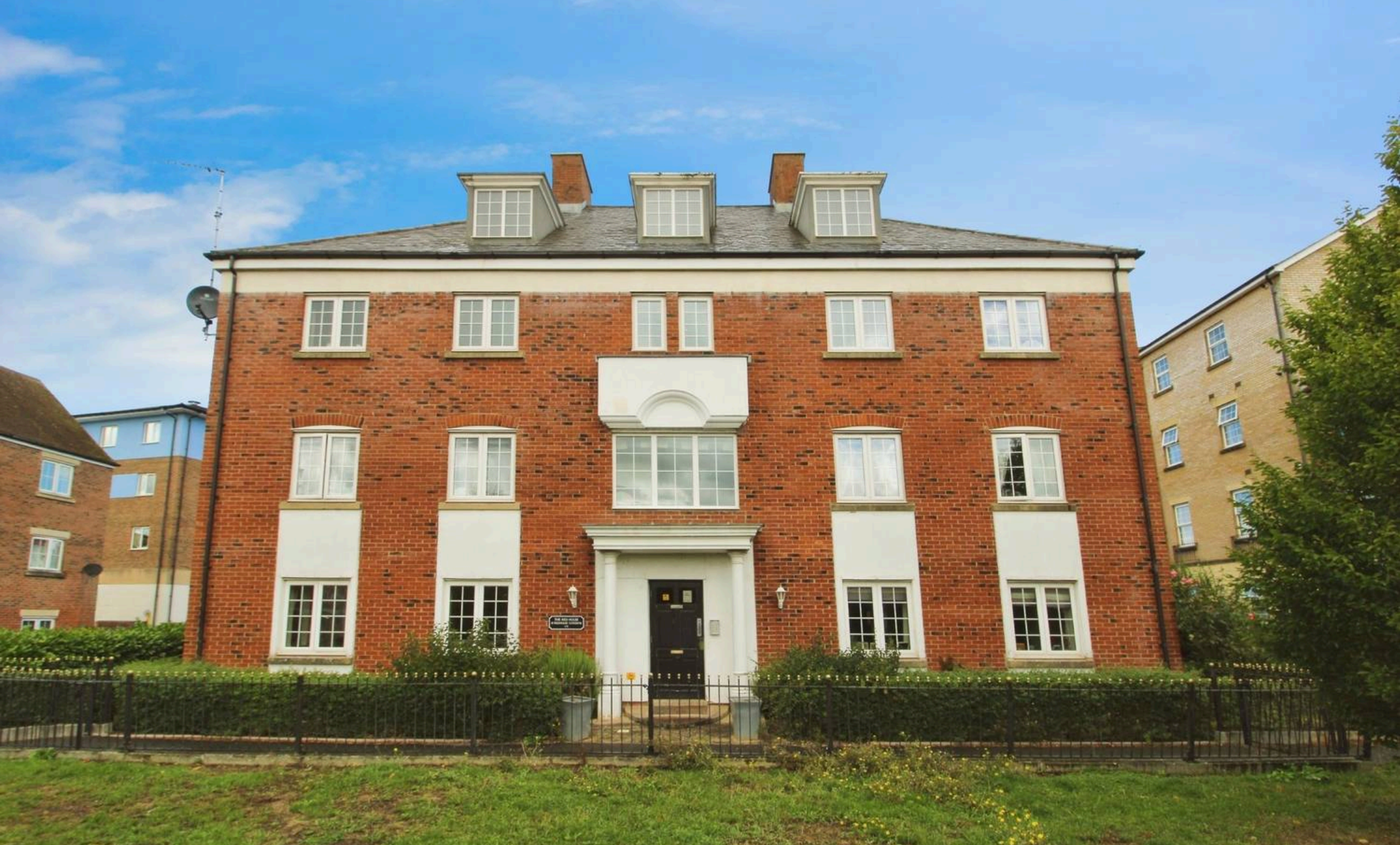
Flat 6, The Red House, 18 Redhouse Gardens Swindon