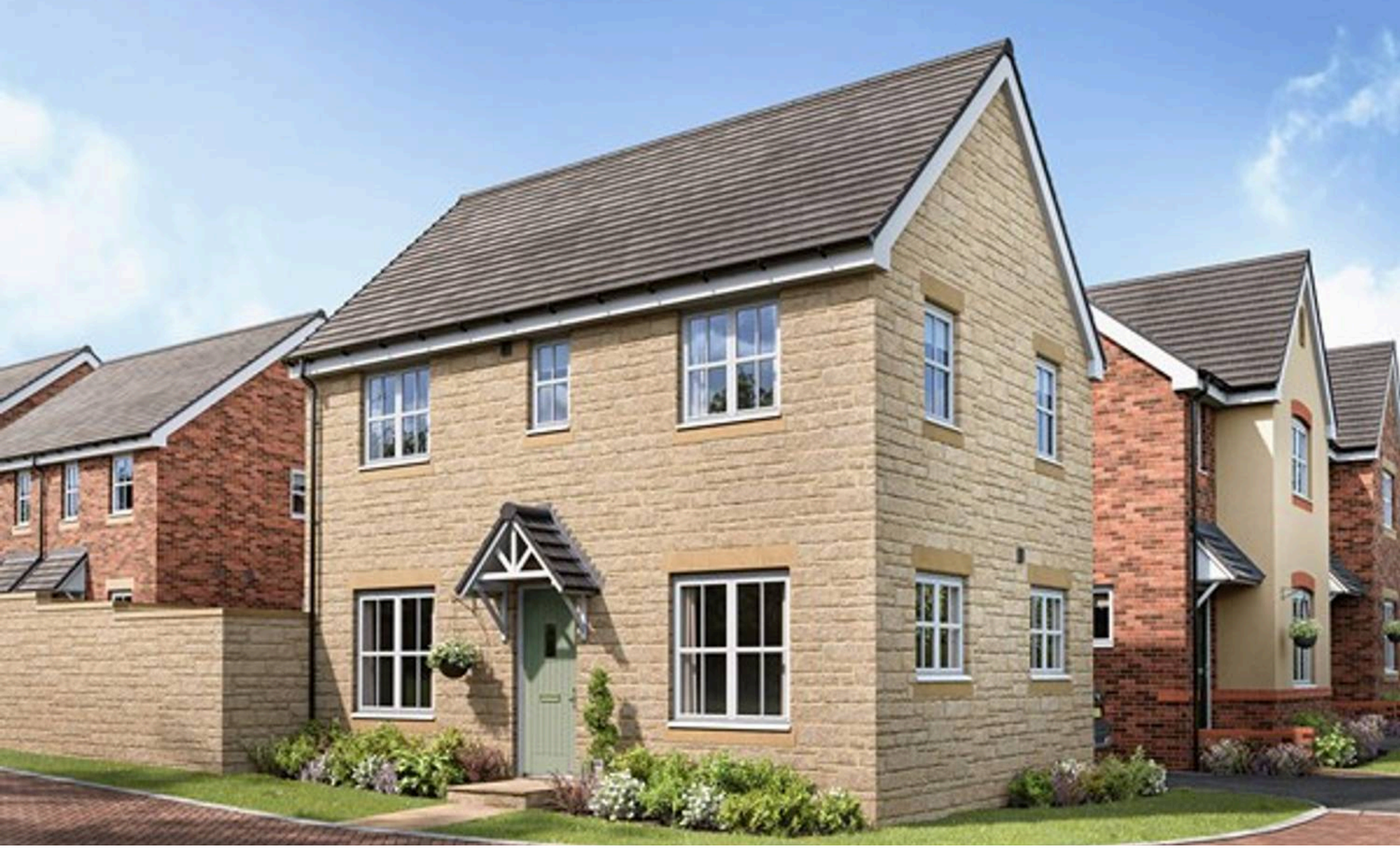
Barnwood, Sillars Green, Tetbury Road Malmesbury