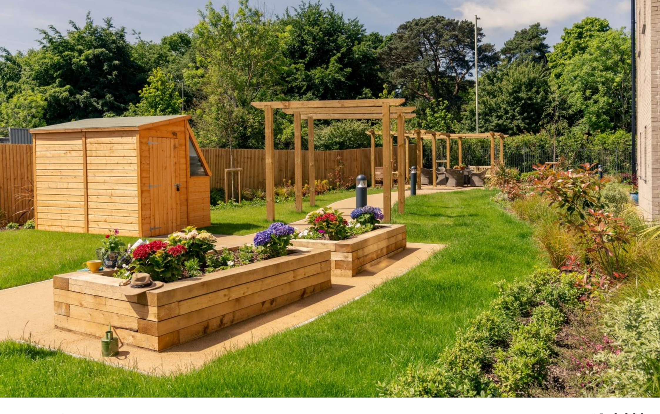
50% Gilbert Place, Lowry Way