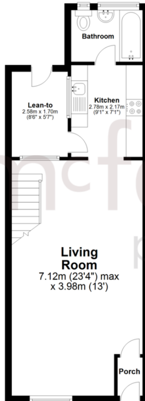
Ground Floor Approx. 43.0 sq. metres (462.8 sq. feet)