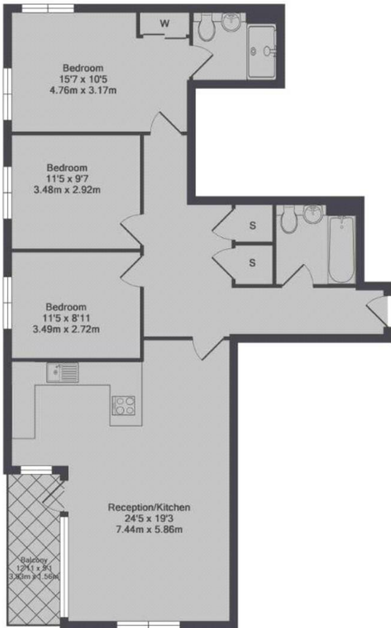
Bodiam Court, NW10 Total Approx. Floor Area 1076 Sq.Ft. (99.9 Sq.M.)