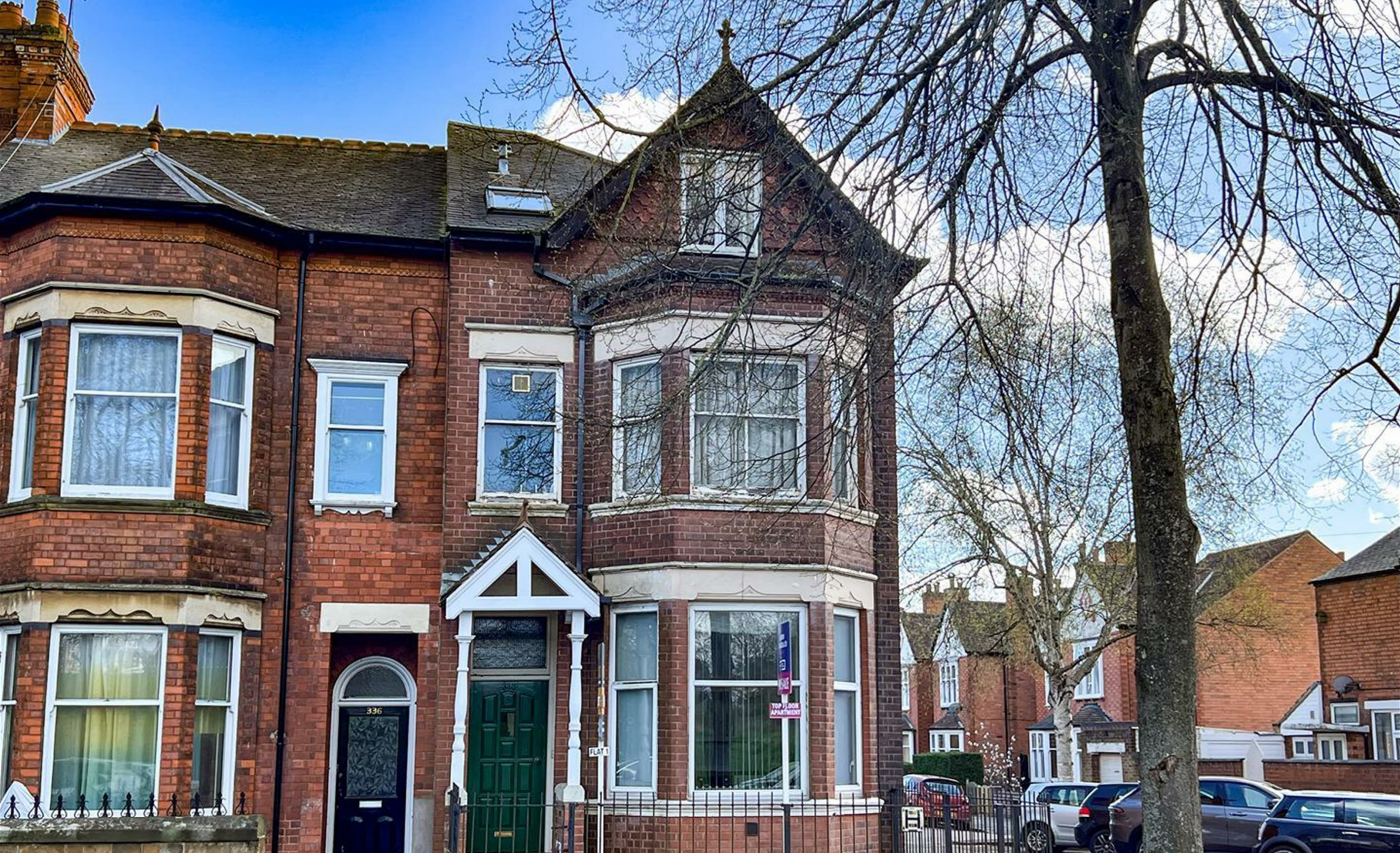
Victoria Park Road, Leicester, LE2 1XF