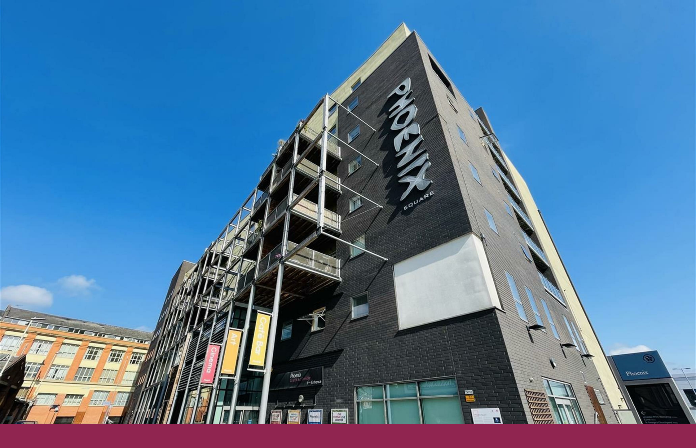
Morledge Street, Leicester, LE1 1TH