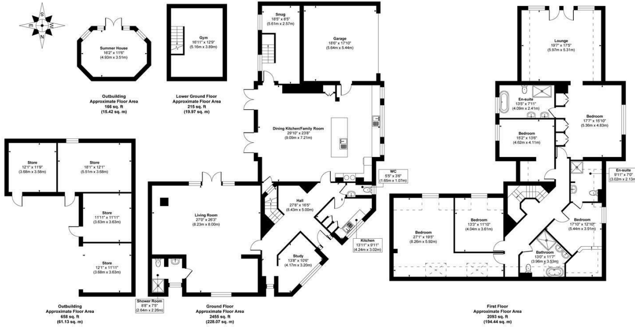
Approx. Gross Internal Floor Area 5587 sq. ft / 519.03 sq. m Illustration for identification purposes only, measurements are approximate, not to scale. Copyright © Zenith Creations.