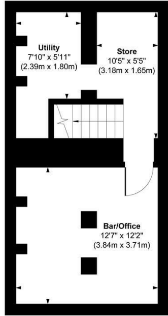
Lower Ground Floor Approximate Floor Area 329 sq. ft (30.60 sq. m)