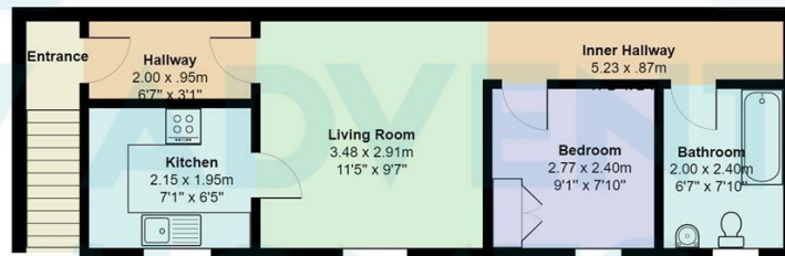
44b, Stalbridge Road, Crewe, CW2 7LP

Whilst every attempt has been made to ensure the accuracy of the floorplan contained here, measurements of doors, windows, rooms and any other items are approximate and no responsibility is taken for any error, omission or mis-statement. This plan is for illustrative purposes only and should be used as such by any prospective purchaser. The services, systems and appliances shown have not been tested and no guarantee as to their operability or efficiency can be given. This Plan was raised on behalf of New Adventure Homes Ltd and should not be used by any other company.