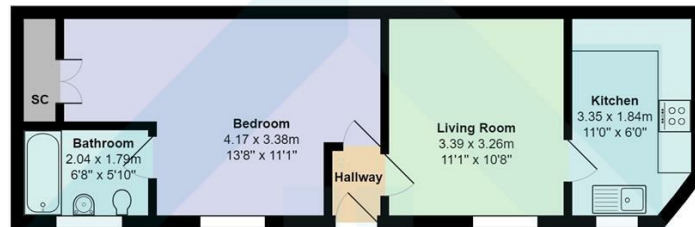
44a, Stalbridge Road, Crewe, CW2 7LP