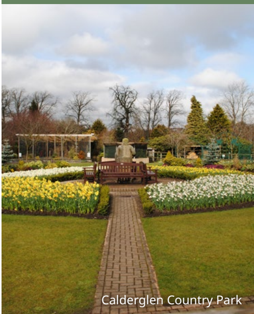
Calderglen Country Park