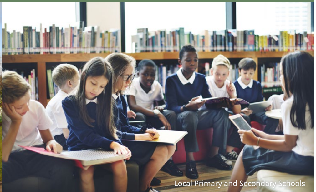
Local Primary and Secondary Schools