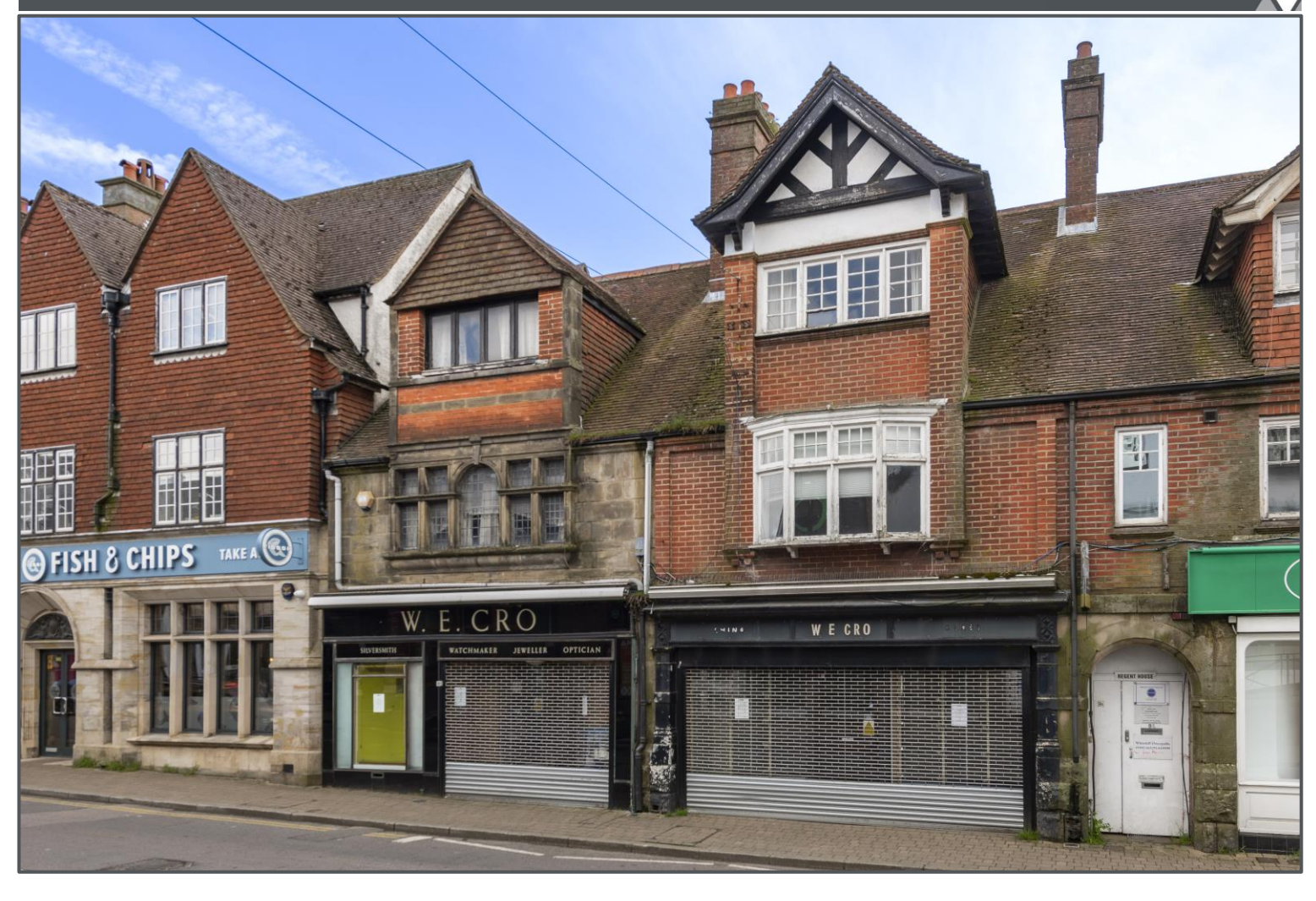
High Street, Crowborough, TN6 2QA