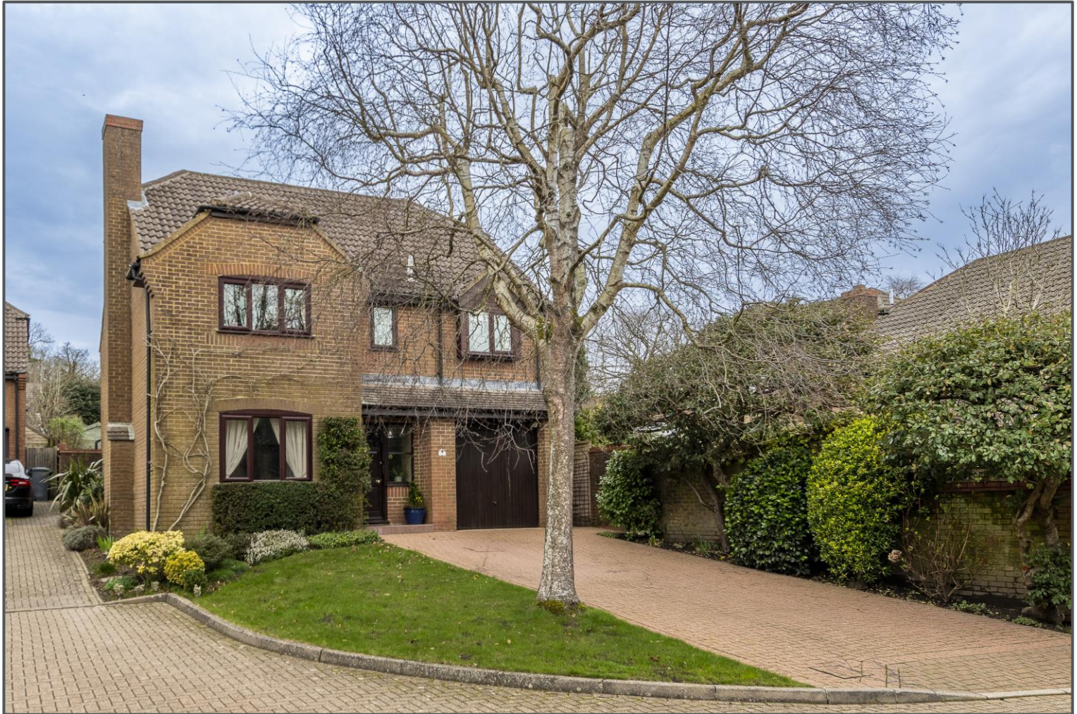
The Grove, Crowborough, TN6 1NY