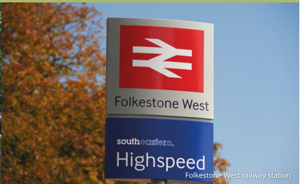
Folkestone West railway station