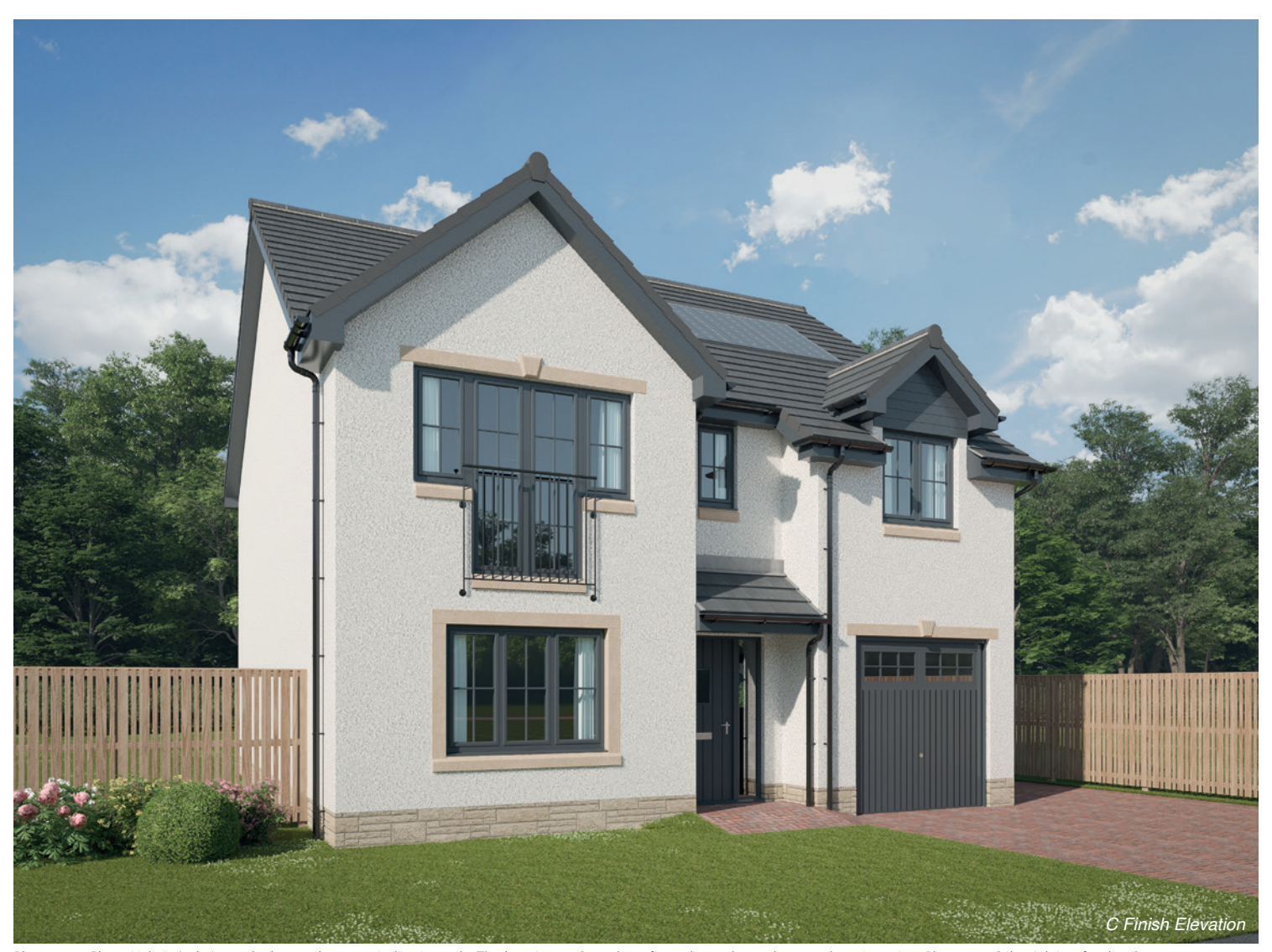
Please note Photo Voltaic (solar) panels shown above are indicative only. The location and number of panels are dependent on plot orientation. Please see Sales Advisor for details.

FOUR BEDROOM DETACHED HOME WITH INTEGRAL GARAGE