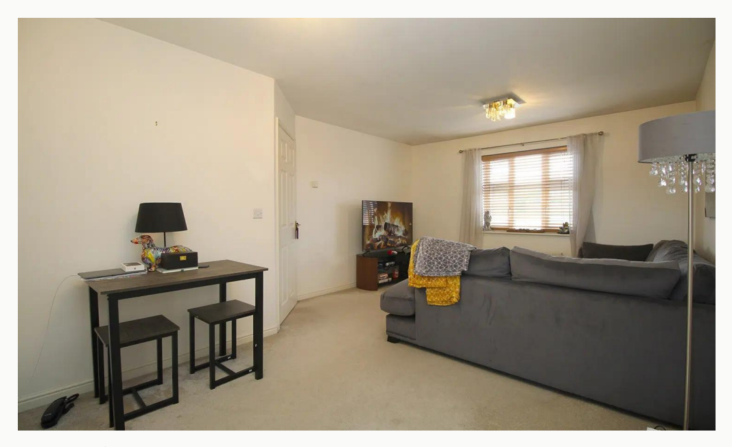
Lounge / Diner