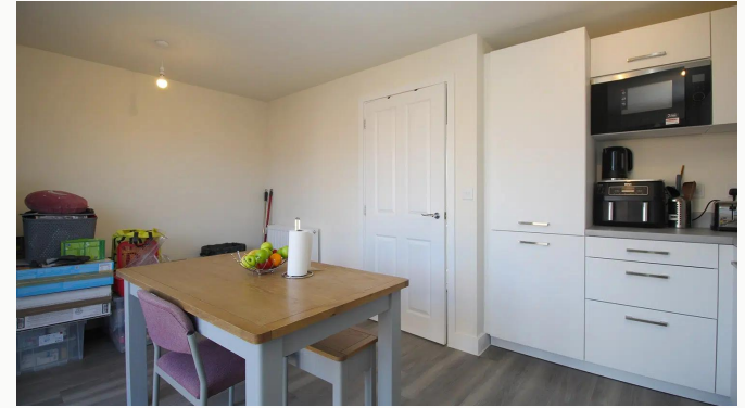
Kitchen / Diner