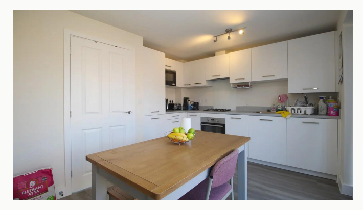
Kitchen / Diner