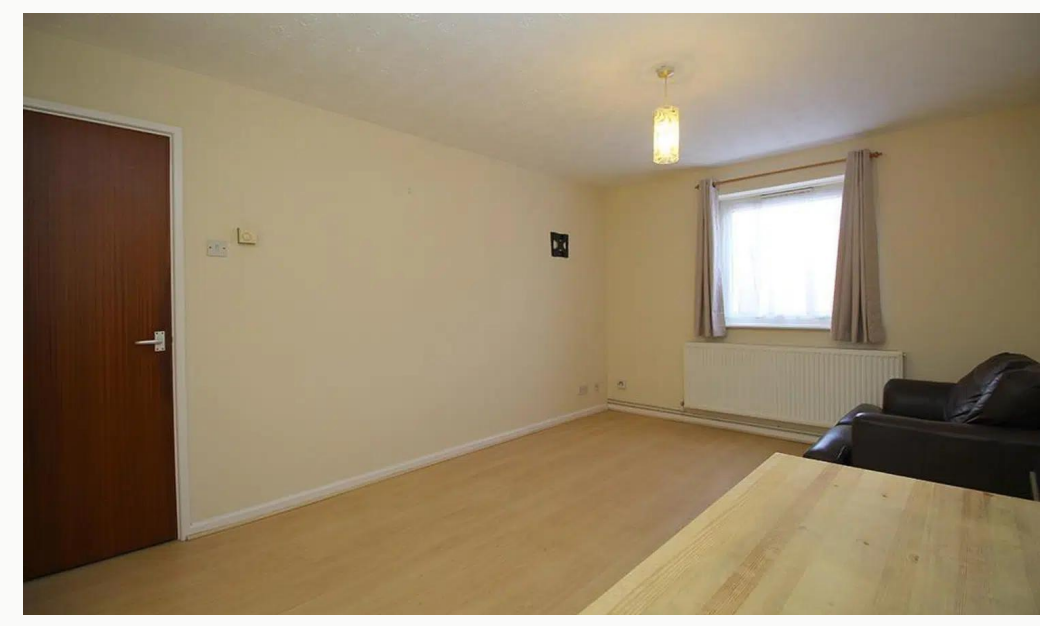
Living Area Living Area