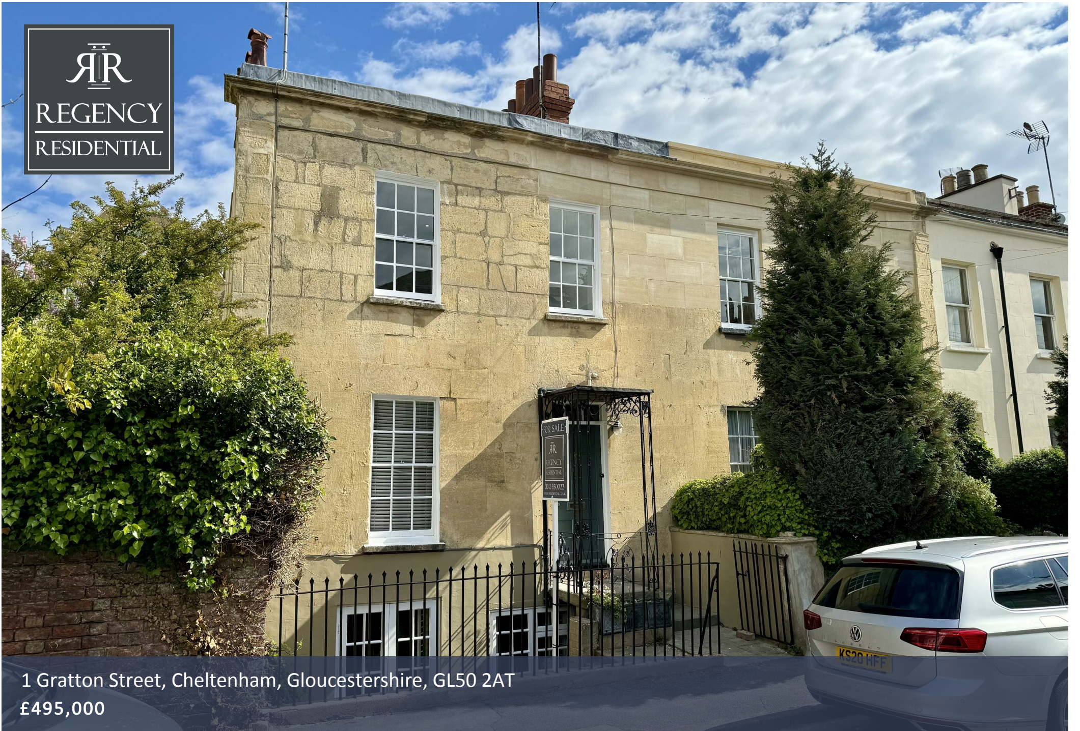
1 Gratton Street, Cheltenham, Gloucestershire, GL50 2AT £495,000