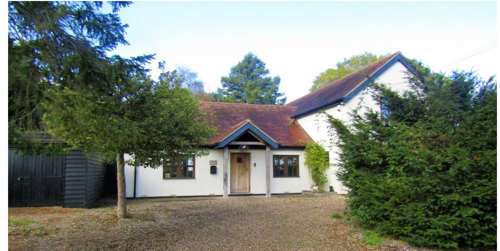
Whitehall Lane Thorpe-le-soken, Clacton-on-Sea

Rent: £2,250 pcm Energy Efficiency Rating C