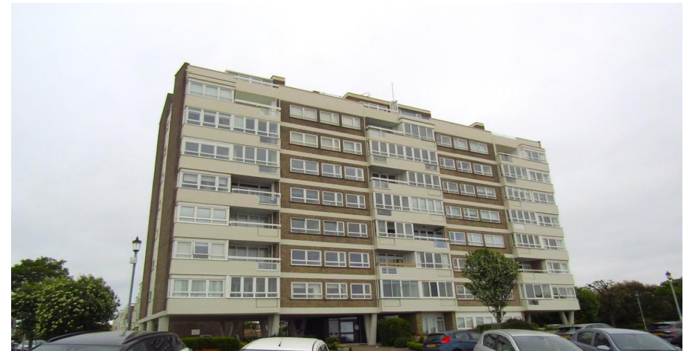
The Esplanade Frinton-on-Sea

Rent: £900 pcm Energy Efficiency Rating E