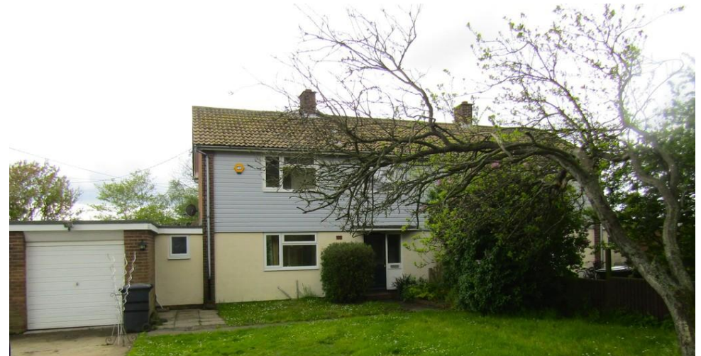
Lane End Cottages