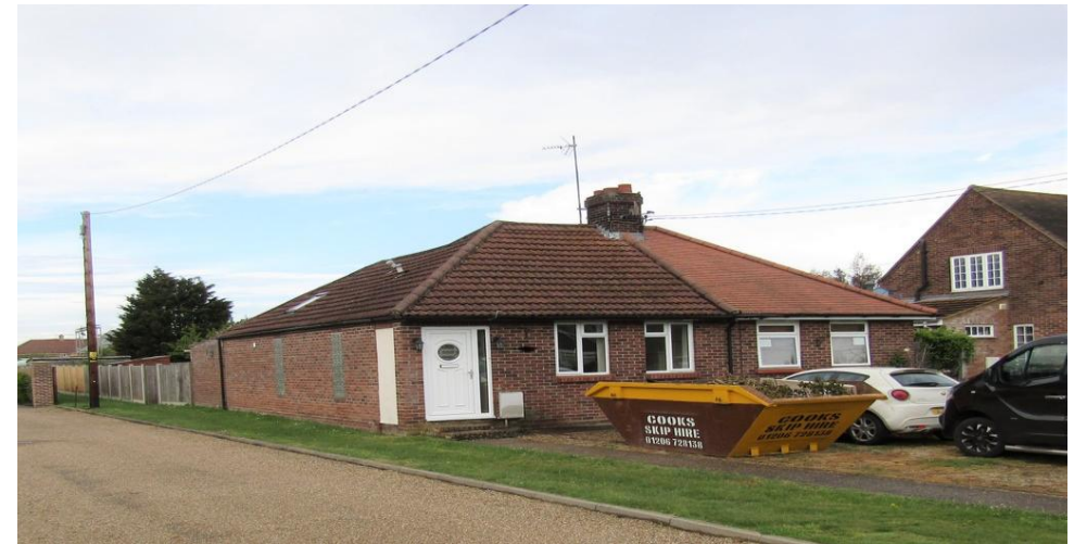
Wivenhoe Road Alresford, Colchester

Agents Note: Whilst every care has been taken to prepare these particulars, they are for guidance purposes only. All measurements are approximate, are for general guidance purposes only and whilst every care has been taken to ensure their accuracy they should not be relied upon and potential tenant: are advised to recheck the measurements.