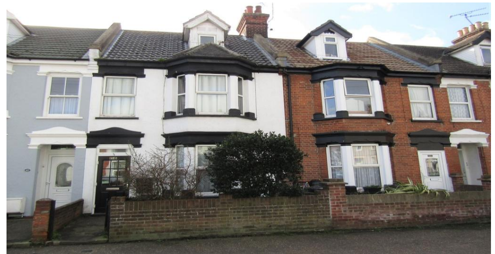
Meredith Road Clacton-on-Sea

Harwich Office 147 High Street Harwich Essex CO12 3AX Tel: (01255) 506655