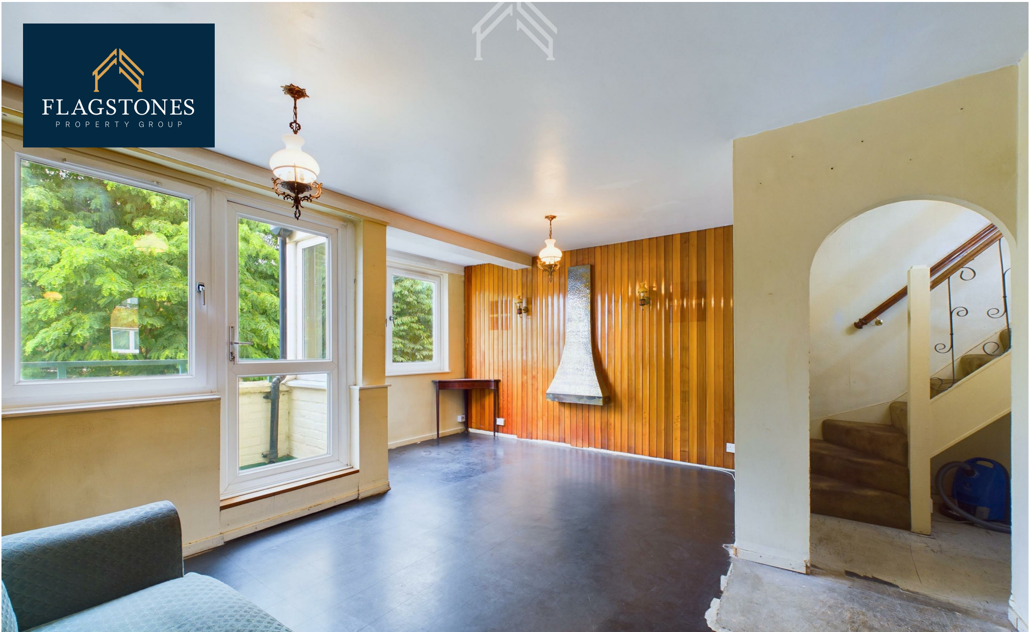
17 Farnham House Harewood Avenue, Marylebone, London, NW1 6NT £625,000