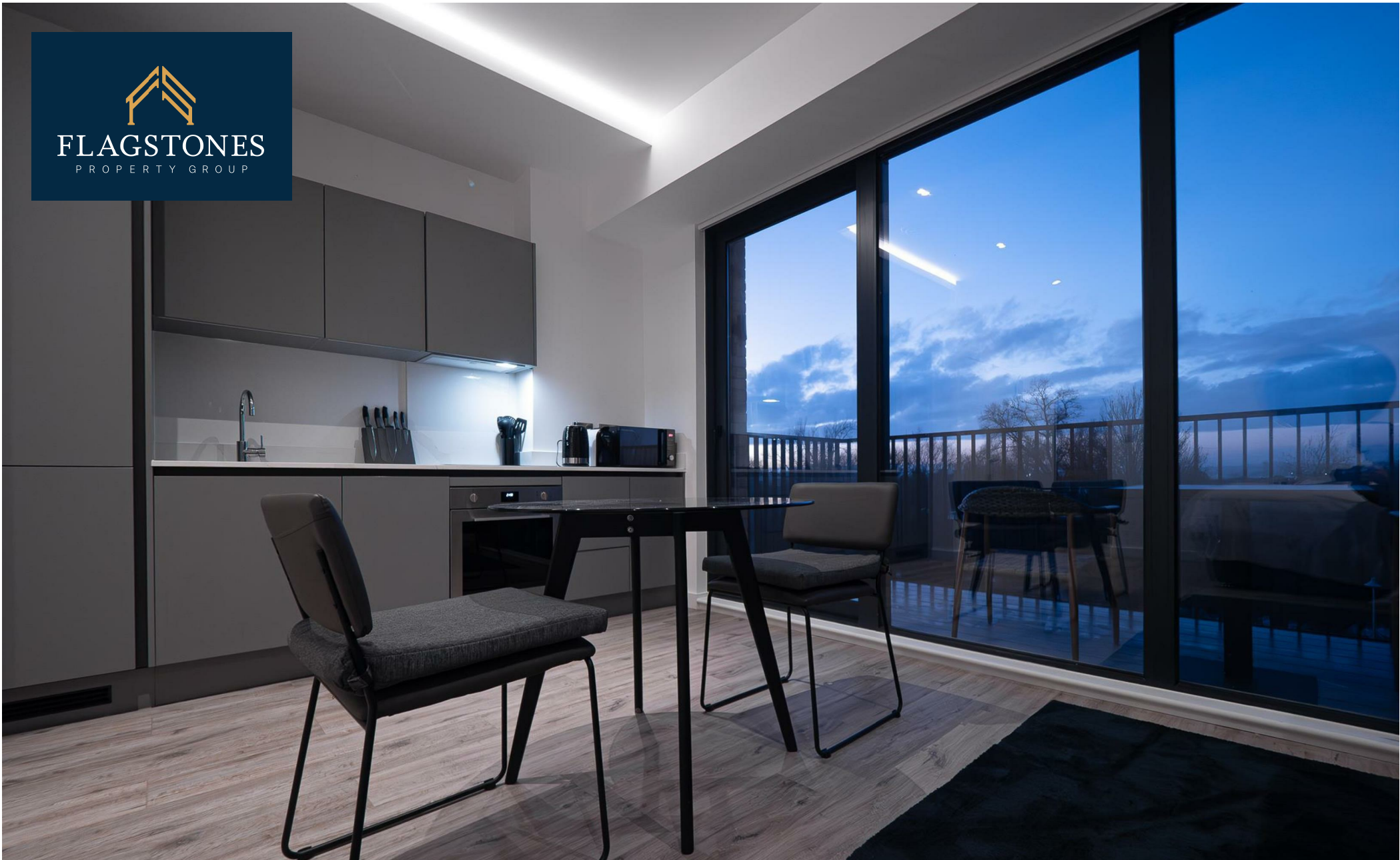
Papermill House, C456 Oxford Road, Uxbridge, UB8 1LZ £1,950