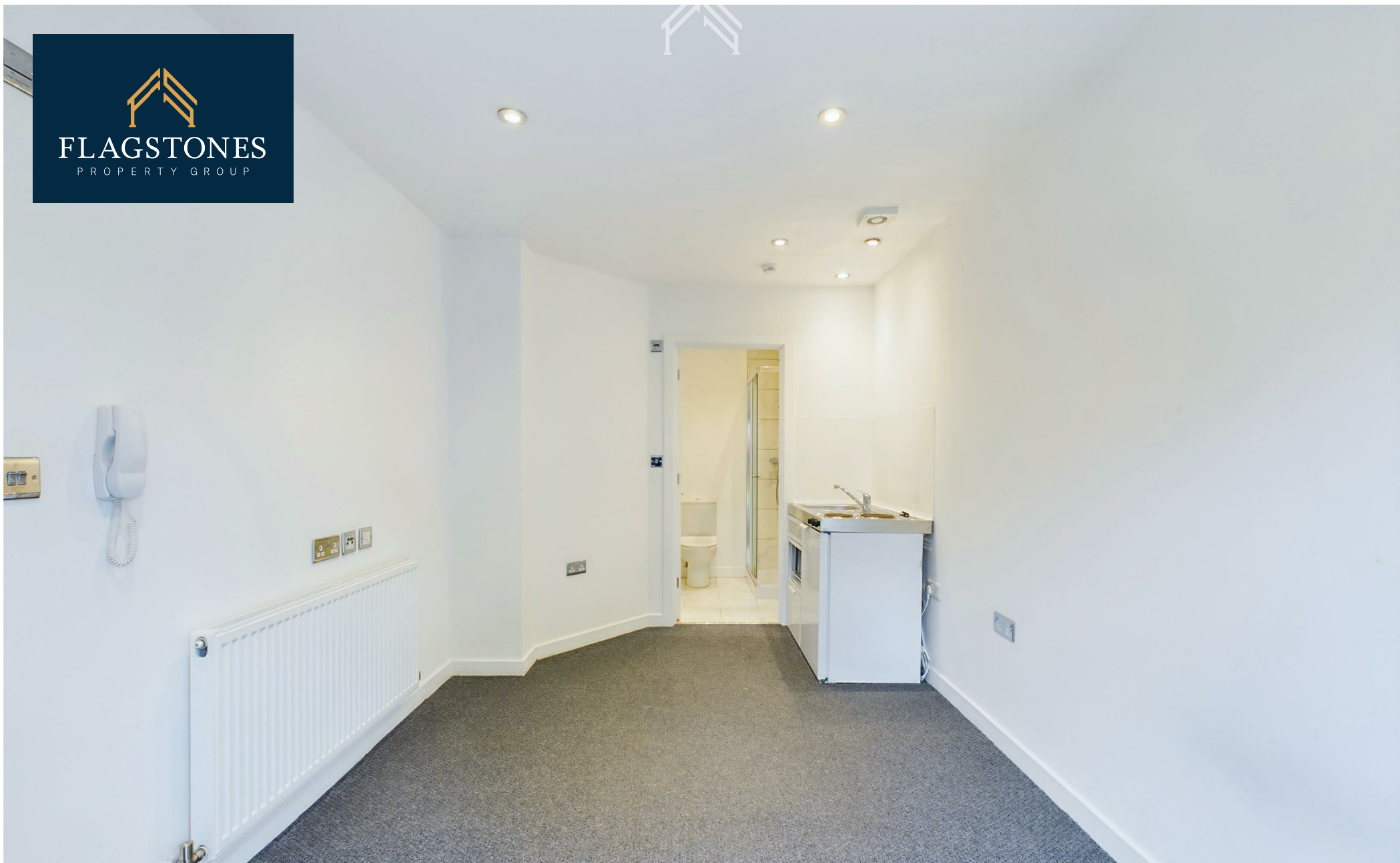
Flat 2, 35 Bamford Avenue, Wembley, HA0 1NB £980