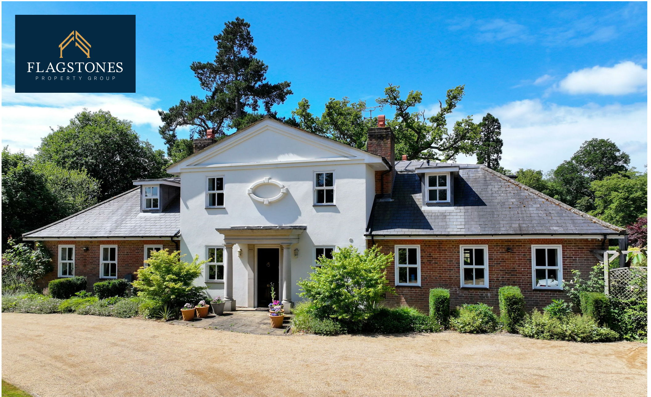
Mulberry House Wildhill Road, Woodside, AL9 6DD £3,950,000