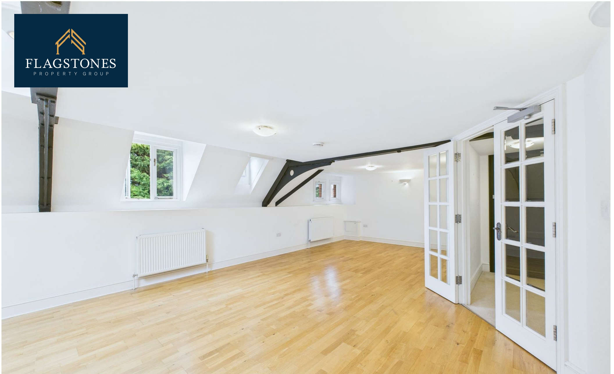
Apartment 35, Convent Court Convent Court, Hatch Lane, Windsor, SL4 3QR £1,600 Per month