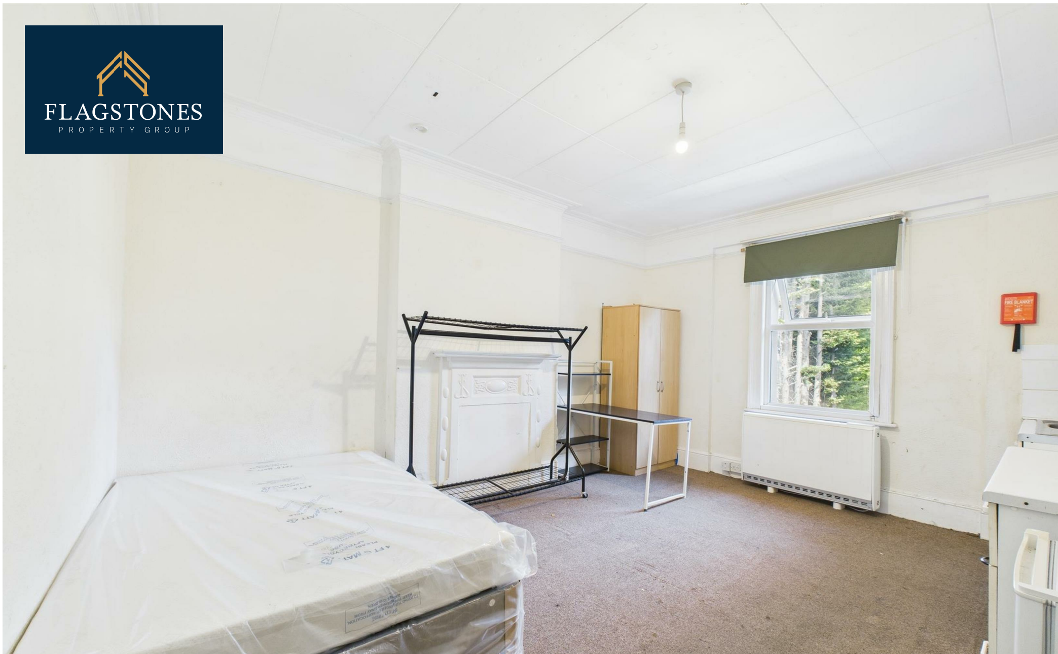
Flat 1, 17 Beech House Road, Croydon, CR0 1JQ £1,000