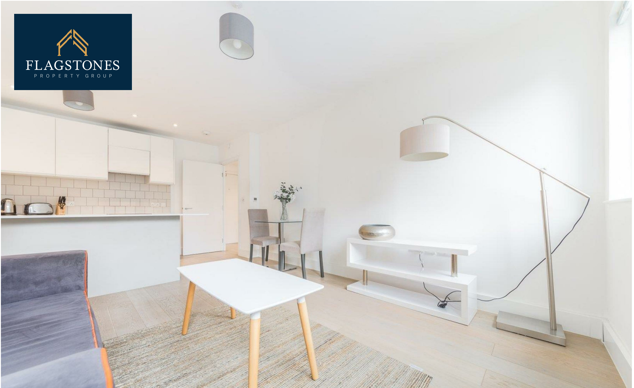
Osborn House, A777 Osborn Terrace, Blackheath, SE3 9GB £1,325