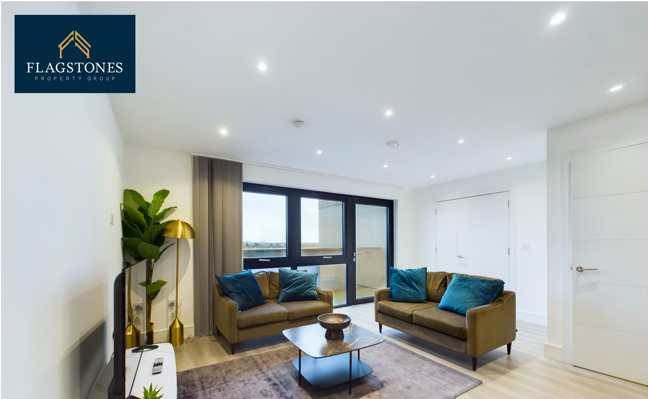
456 New-Horizons-Court, Akron House, Brentford, Uk, TW8 9GQ £2,800