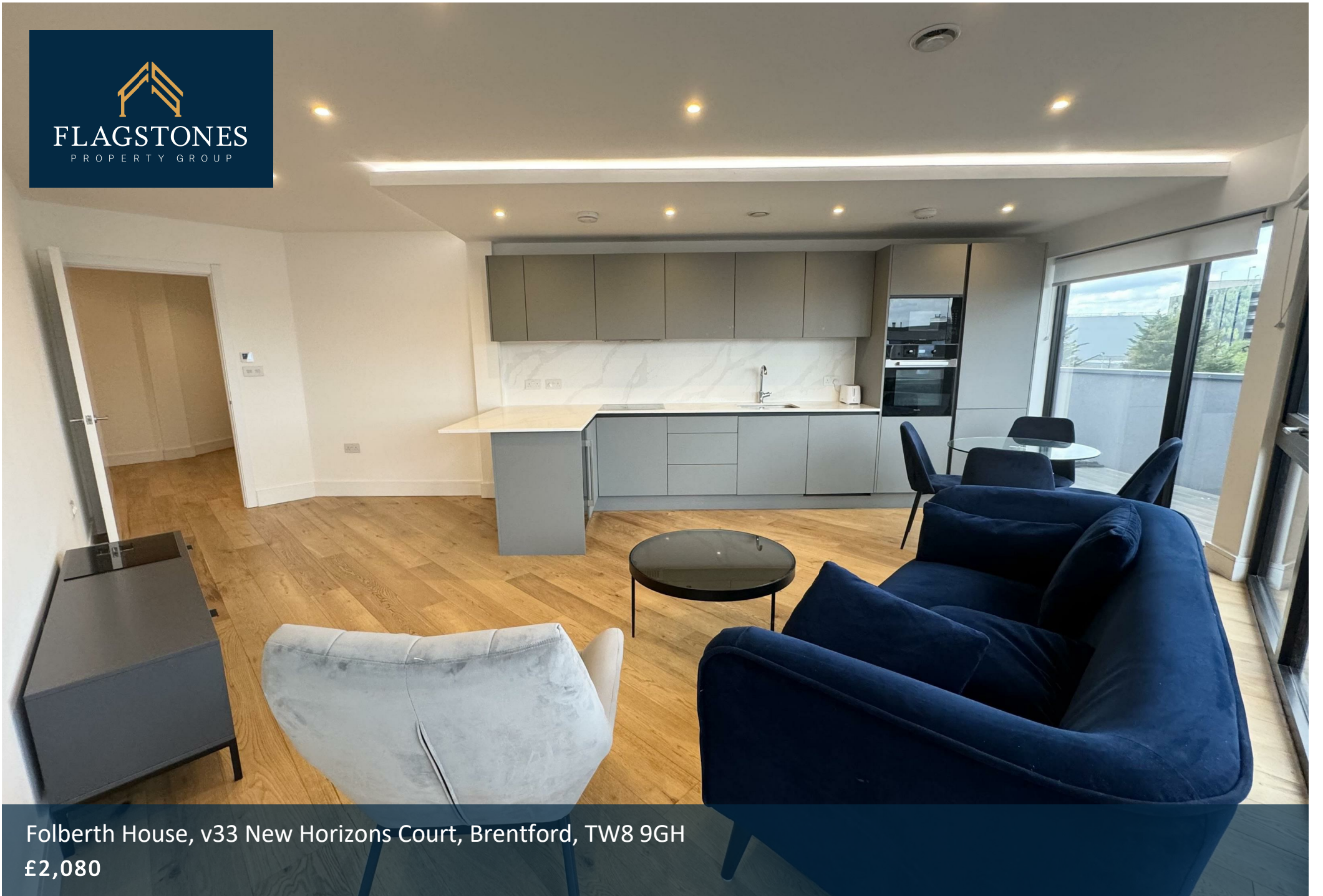
Folberth House, v33 New Horizons Court, Brentford, TW8 9GH £2,080