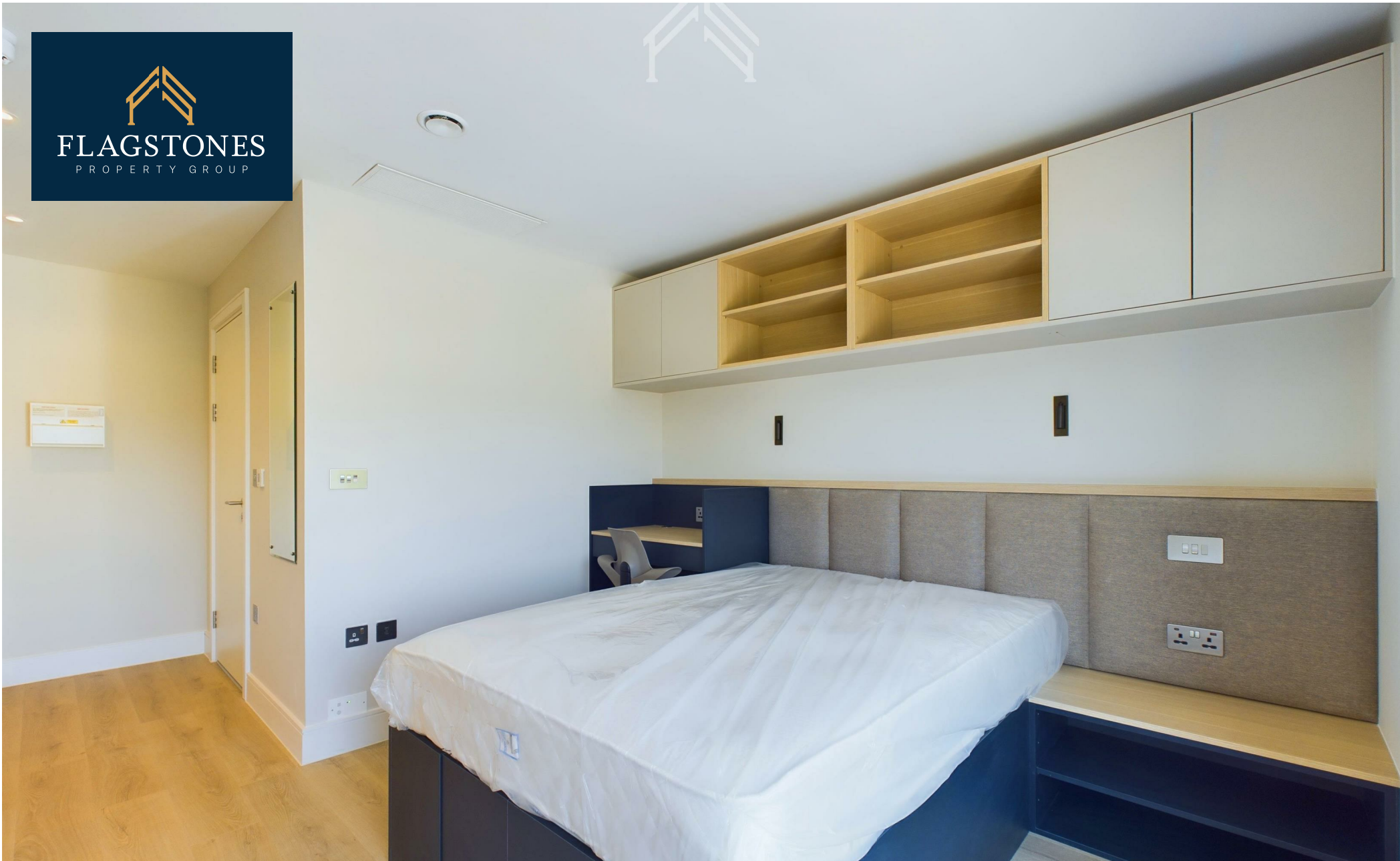
3 The Mall, Apiary Co-Living, Ealing, W5 2PJ £1,400