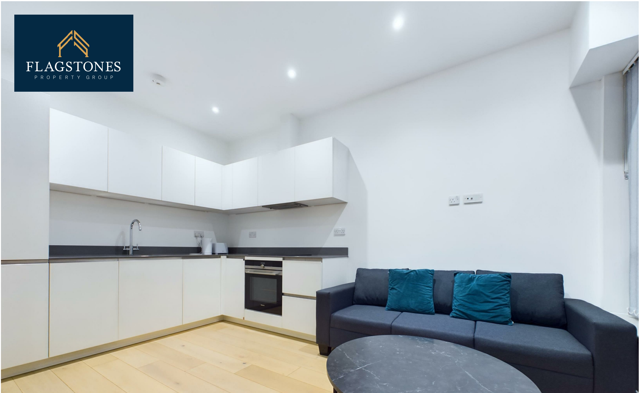
Broad House, b59 Imperial Drive, Harrow, HA2 7DP £1,750