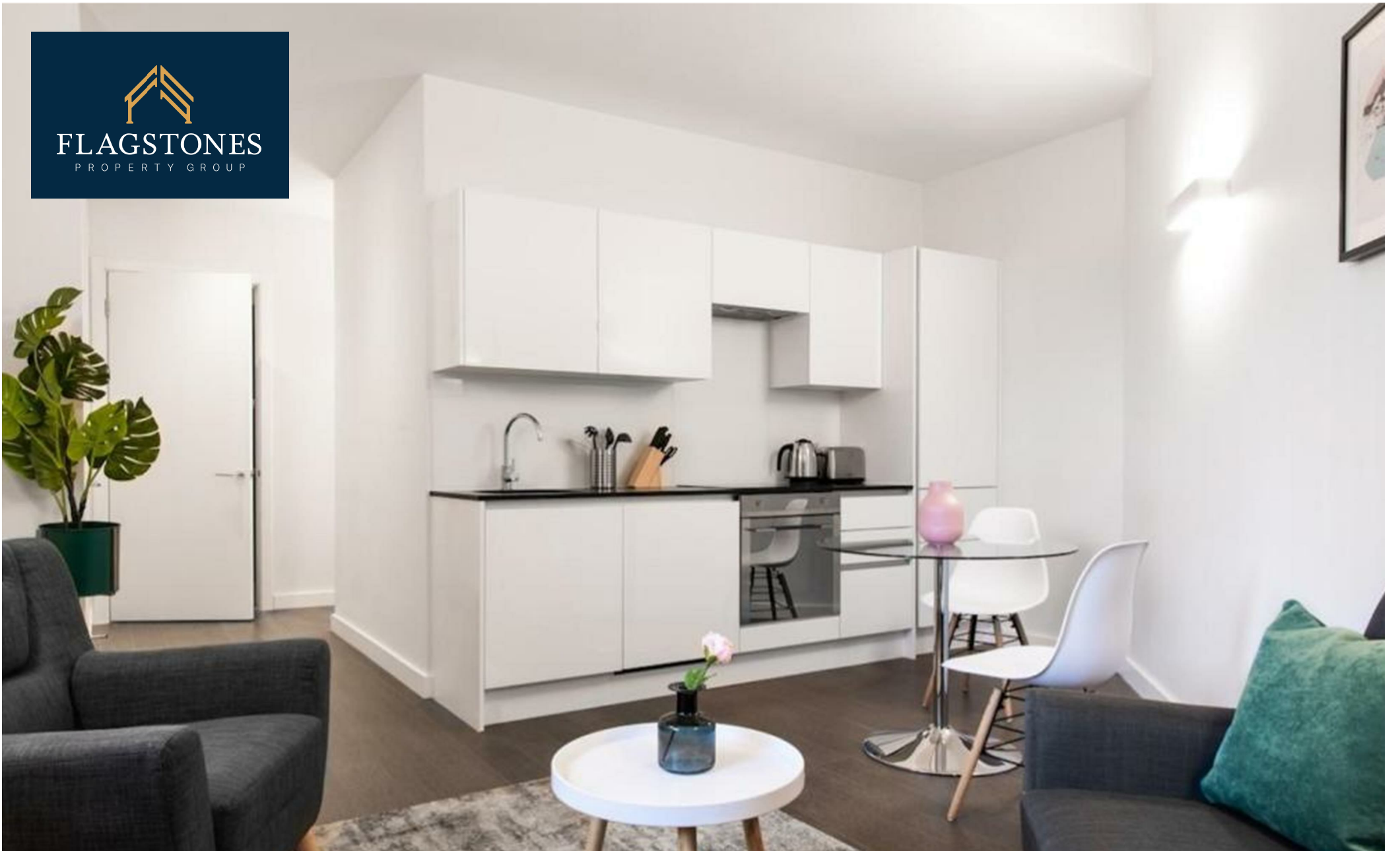
Abbott House, A29 Everard Close, St. Albans, AL1 2BZ £1,420