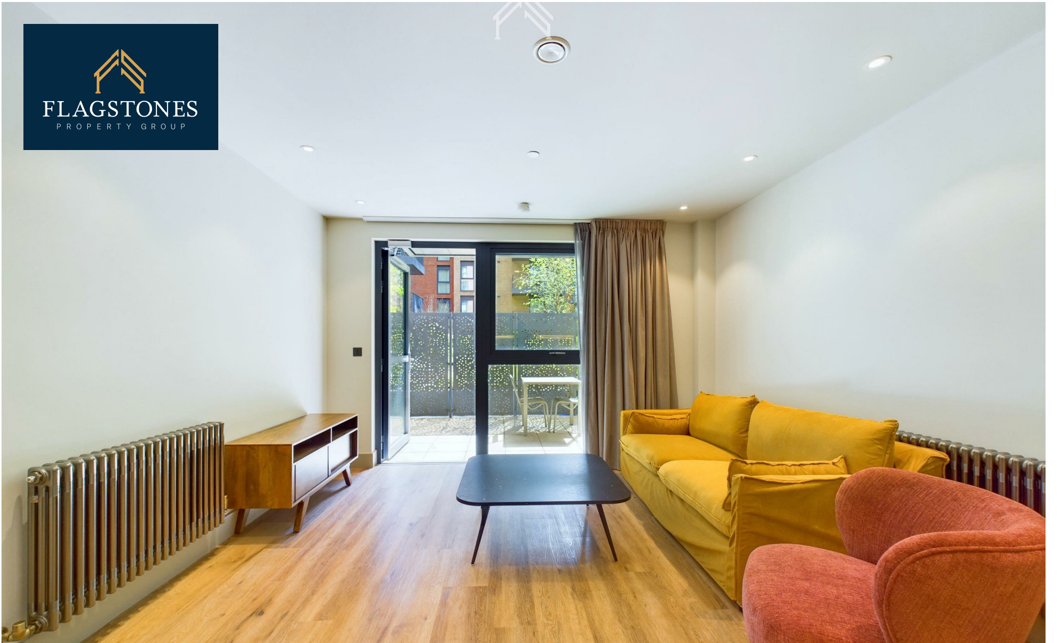
Flat 2 Sessile Apartments Ashley Road, London, N17 9ZS £2,405