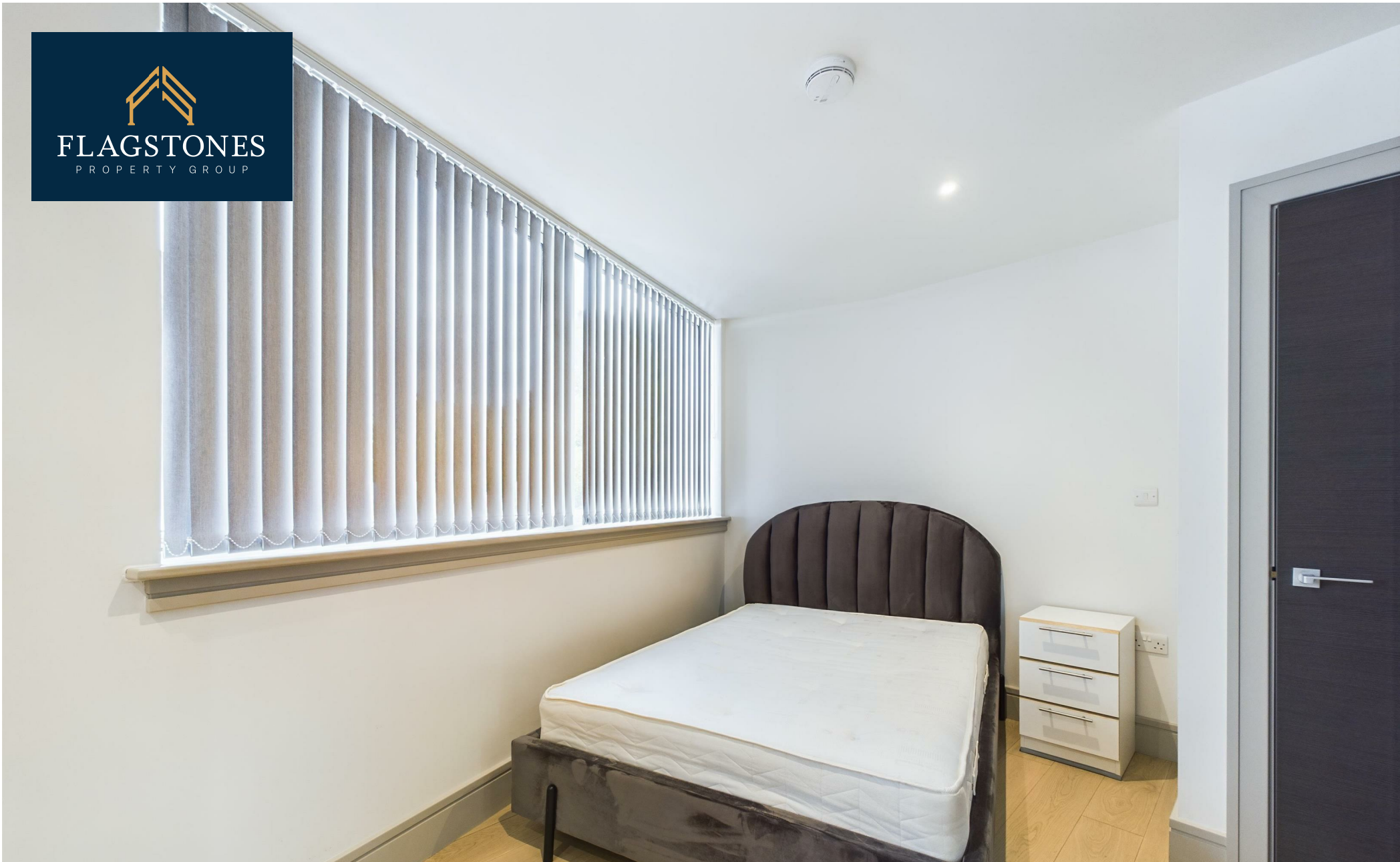
Flint Court, 346 High Road, North Finchley, N12 0BT £1,375