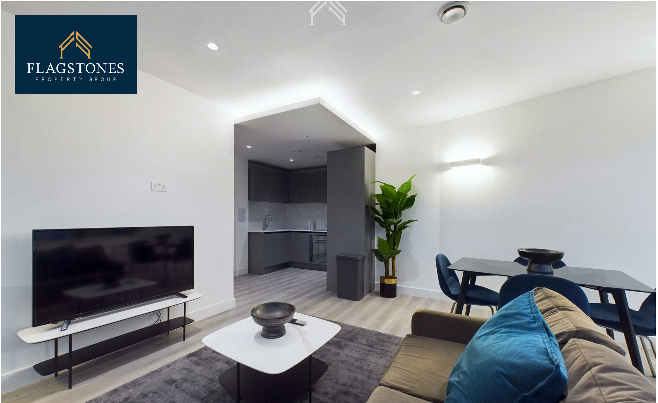
587 New-Horizons-Court, Akron House, Brentford, Uk, TW8 9GQ £2,000