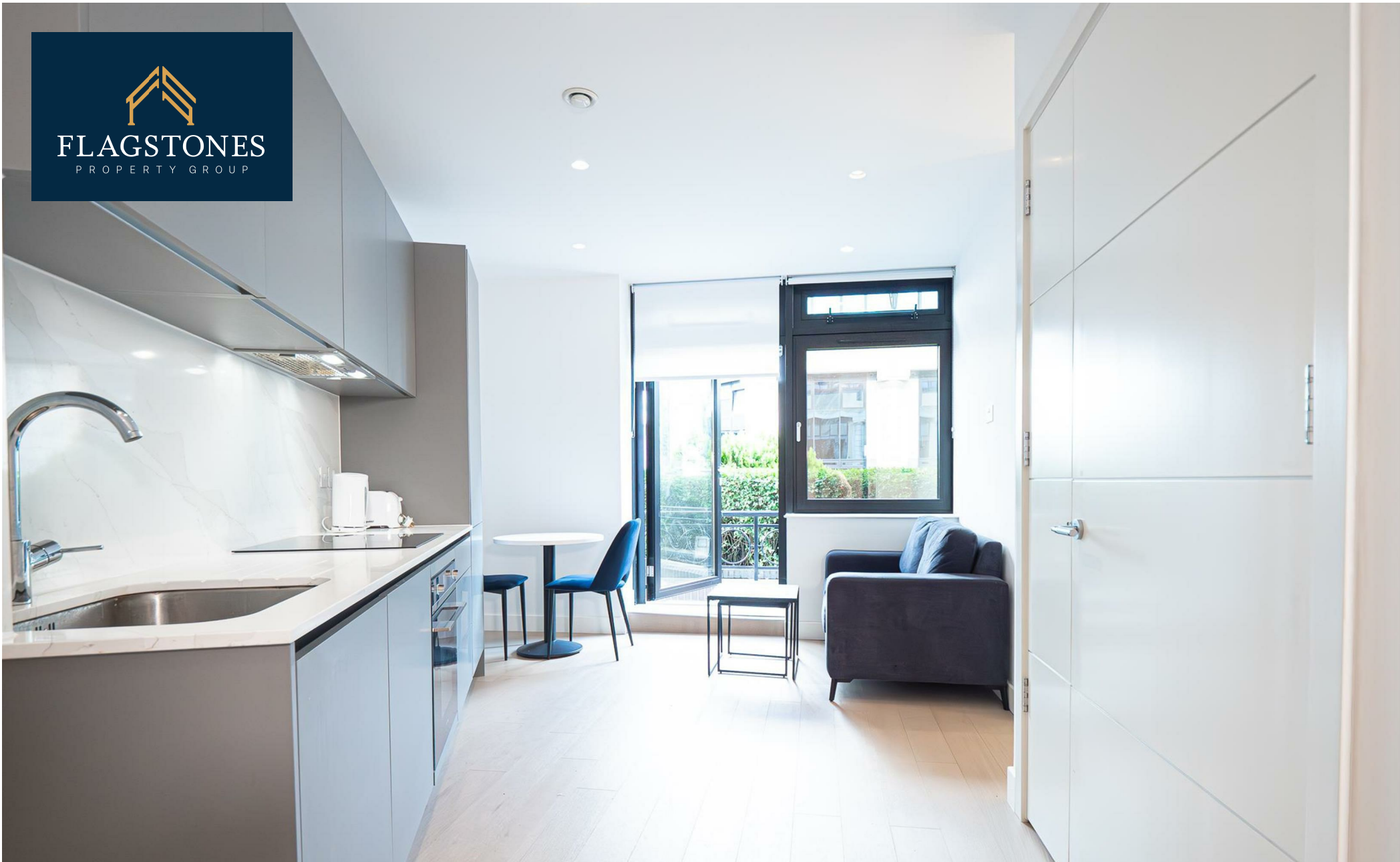
2 New Horizons Court, Brentford, TW8 9GJ £1,400