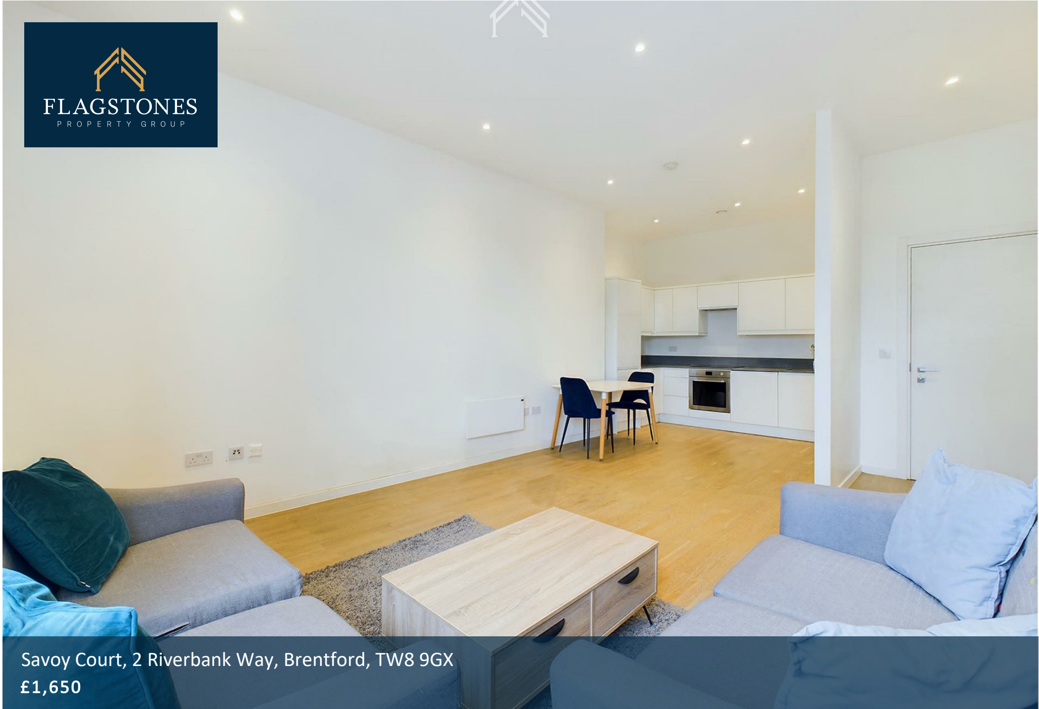
Savoy Court, 2 Riverbank Way, Brentford, TW8 9GX £1,650