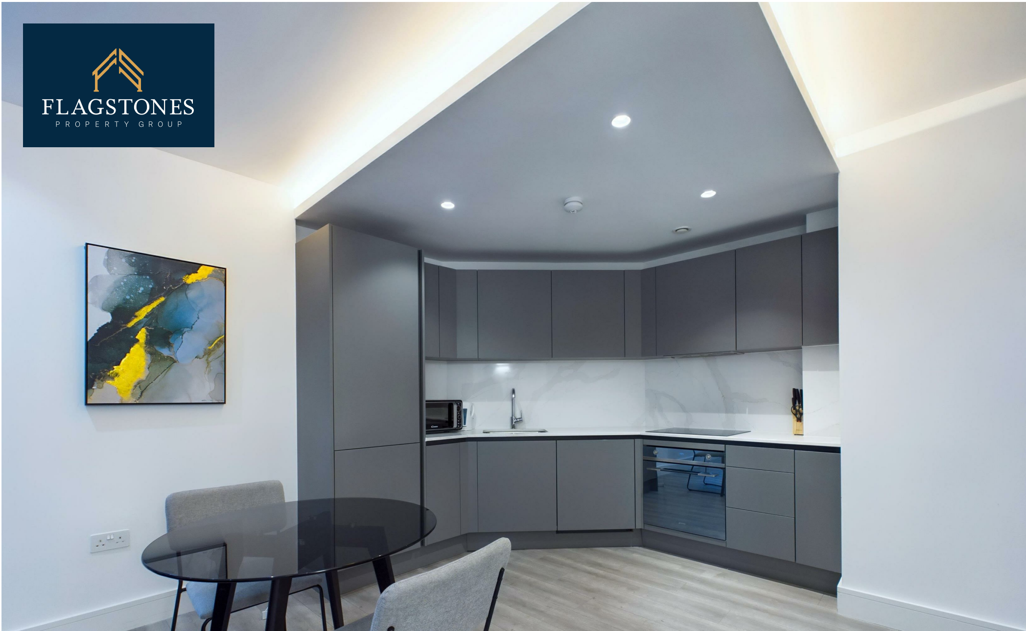
Akron House, 505 New Horizons Court, Brentford, TW8 9GQ £1,300