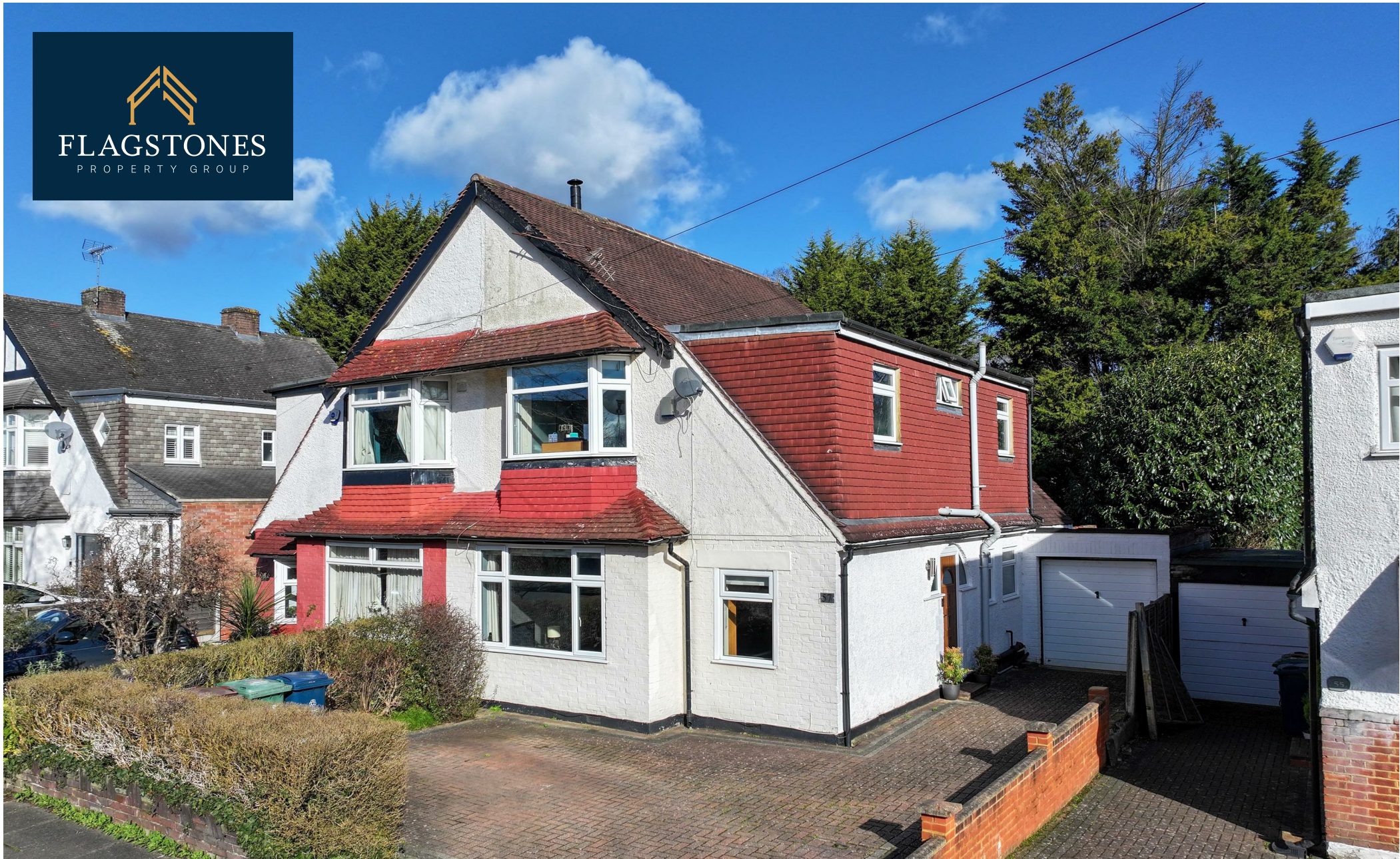
57 Sylvia Avenue, Pinner, HA5 4QN £900,000