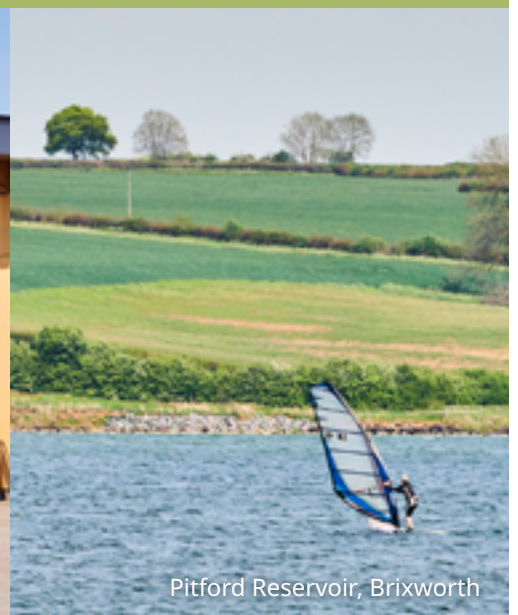
Pitford Reservoir, Brixworth