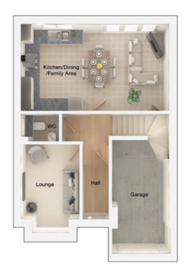
Kitchen/Dining/Family Area 20'6" x 12'1" Lounge 8'1" x 12'3" WC 5'3" x 3'10" Garage 7'11" x 15'10"