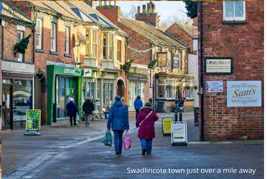
Swadlincote town just over a mile away