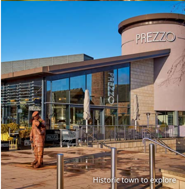
Historic town to explore