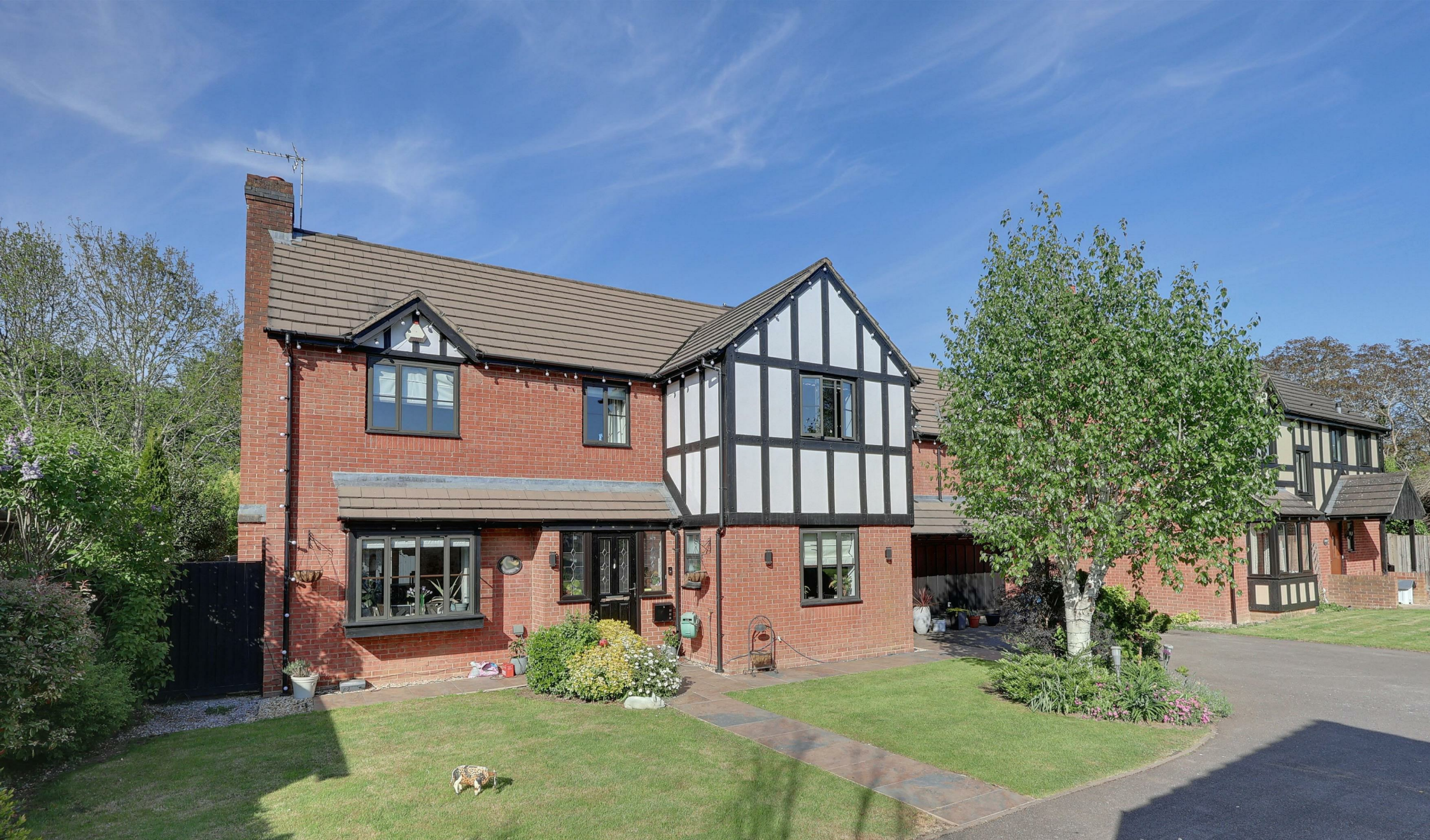
6 The Orchards, Hucclecote GL3 3RL £775,000