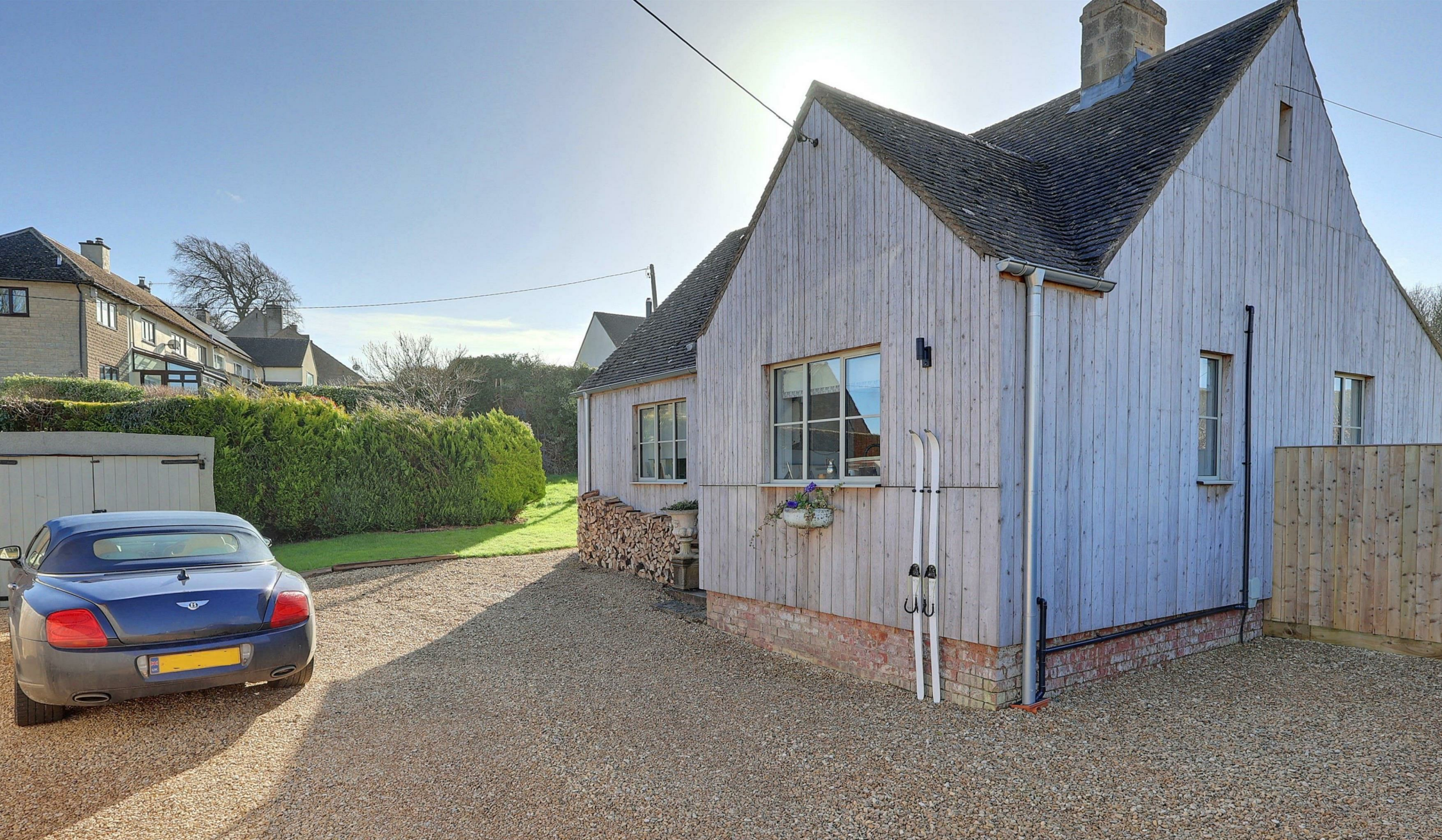
Knoll Lodge The Knoll, Cranham GL4 8HR £535,000