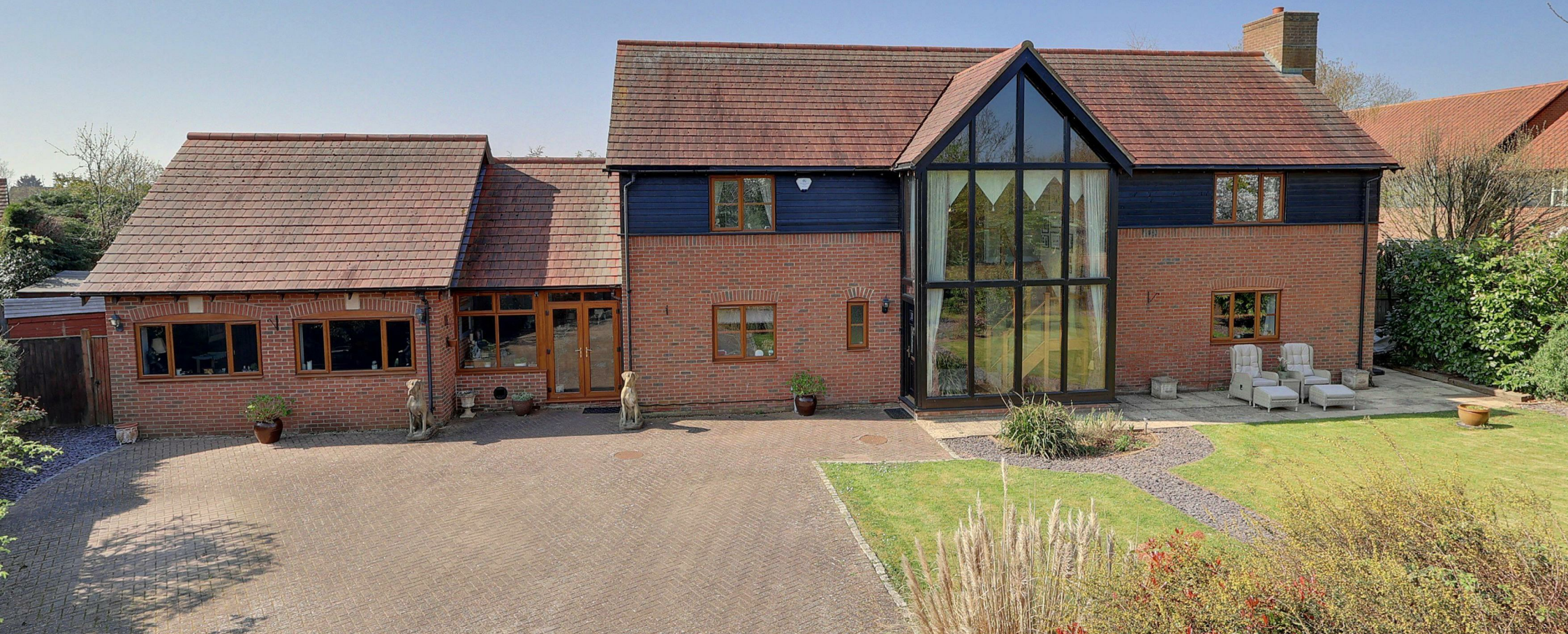
Hazel Barn 1 Greenfields, Churchdown GL2 9QT £1,170,000